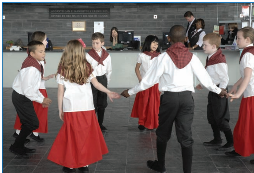
Children from around Wales take part in displays of traditional dancing at the Senedd, during the Year of Catholic Education celebration.