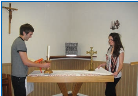
Ethos Ambassadors dressing the altar ready for mass.

In order to safeguard and promote its ethos, St Joseph's elects two students from the sixth form to act as Ethos Ambassadors, in addition to the traditional roles of Head Boy and Head Girl. The Ambassadors work with the School Chaplain and play a full and active