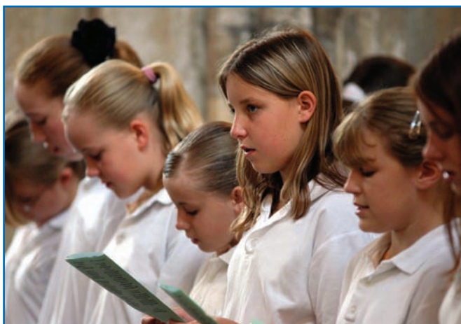
Learners from Bishop of Llandaff Church in Wales High School at worship in Llandaff Cathedral.

The Welsh Government acknowledges as reasonable the aspiration of parents and carers to educate their children in the context of a faith worldview. Our purpose here is to highlight the ways in which such schools are distinctive, but not exclusive, in how they approach education, promote community cohesion and help learners flourish and reach their potential. We hope to dispel some of the common myths and unhelpful presuppositions that commentators can sometimes express with regard to the place of such schools within the system. We aim, thereby, to promote respectful and intelligent dialogue and affirm our mutual understanding of the appreciable and constructive contribution schools with a religious character make to our common life as a nation.