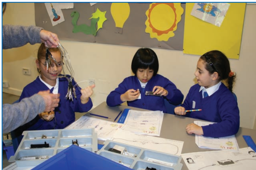
Learners at Ysgol Gynradd Gatholig Ein Harglwyddes, Bangor learning about electricity.