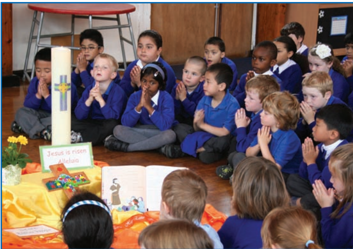
Collective worship at Ysgol Gynradd Gatholig Ein Harglwyddes, Bangor.

. . . the opportunity for pupils to worship God, to consider the spiritual and moral issues and explore their own beliefs; to encourage participation and response, whether through active involvement in the presentation of worship or through listening to, watching and joining in the worship offered; and to develop community spirit, promote common ethos and shared values, and reinforce positive attitudes.