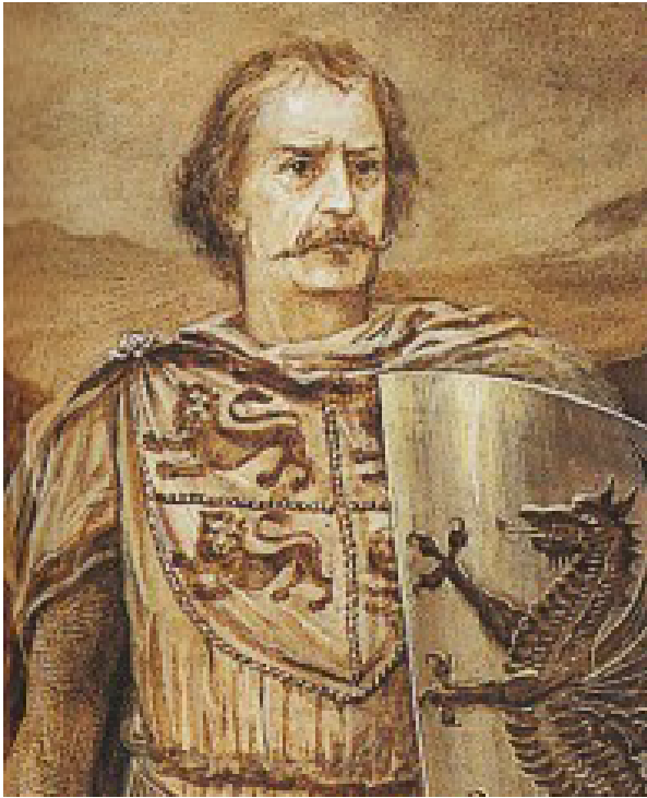
An artist's impression of Llywelyn ap Gruffudd © Thomas Prytherch/Creative Commons

commitment to Welsh unity and independence. As Prince of Wales, he wanted to lead the often argumentative Welsh lords, creating a united front against the looming English Crown.