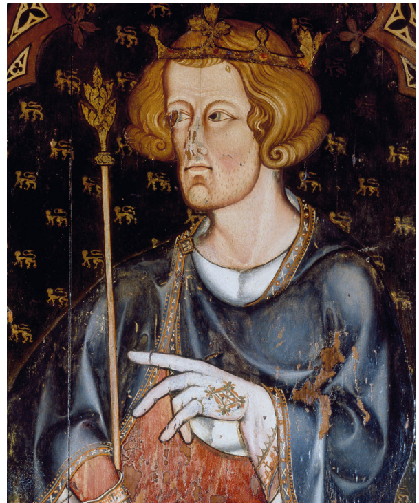
A painting of Edward I c. 1280

Edward I, by contrast, was a king who wanted a centralised and large English monarchy. His ambition was to bring the British Isles under English control, a goal he pursued relentlessly in Wales, Scotland, and Ireland. Edward was a skilled military strategist and an astute politician, using force and law to assert his authority. His conquest of Wales, marked by building his massive castles and giving his son the title of Prince of Wales,