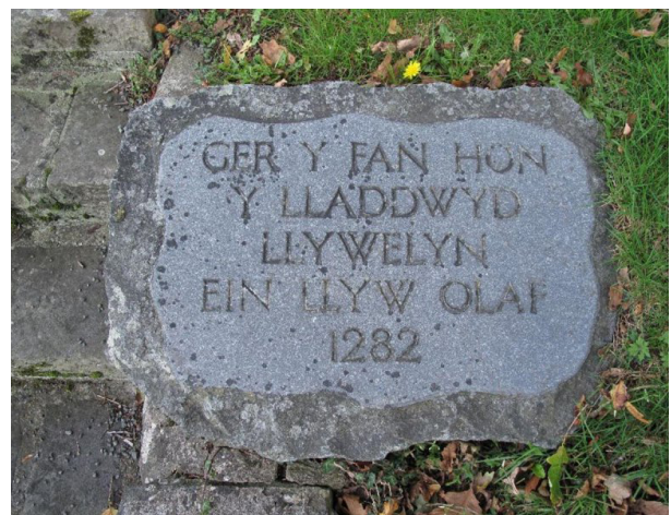
Detail from Llywelyn's Monument Cilmeri

The legacies of Llywelyn and Edward are very different. Llywelyn is remembered as a hero and martyr for Welsh independence, his death in 1282 symbolising the end of a free Wales.