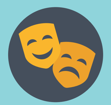
In Expressive Arts , your child will explore art, dance, drama, film and digital media and music to develop their creative, artistic and performance skills.